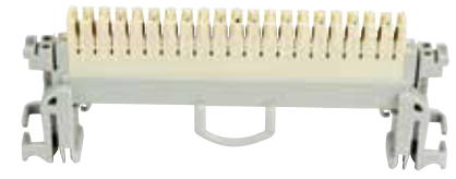
3M™ Disconnection Module STG2 C2

The 3M™ Switching Module (“normally opened”) STG2 O2 provides a connection that can only be made by insertion of a test cord, patch cord or a protector. It is typically used as a flexible connection point with patch cords or a safety connection point which allows isolation of the line when the protector is removed.