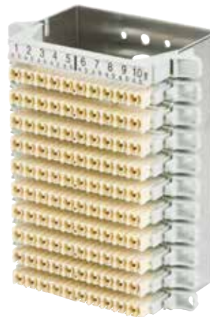
3M™ High Density Cross-Connect Module STG2000 in a 100-pair block configuration

The 3M STG2000 modules feature 3M IDC technology which offers reliable performance for mechanical wire retention, multiple re-terminations, and environmental protection to gas-tight connection. The modules can connect solid copper conductors in a range of diameters from 26 (0.4 mm) to 20 AWG (0.8 mm) with a maximum insulation sheath of 15 AWG (1.5 mm).