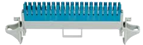
3M™ Switching Module STG2 O2