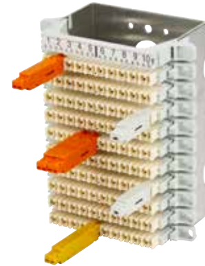
3M™ High Density Cross-Connect Module STG2000 100-pair block with single pair protectors